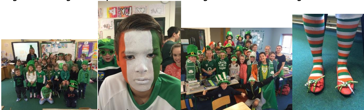
Pictures from non uniform day!